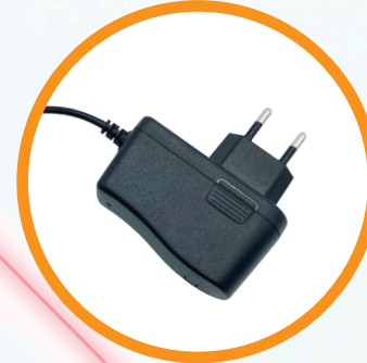
WALL CHARGER USB TYPE C available in EU & US plug