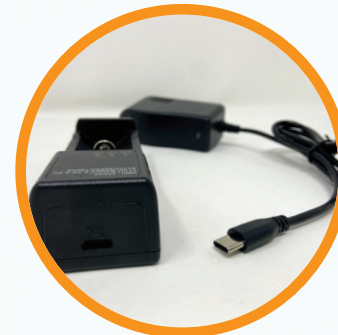
NEW DOCKING STATION WITH USB TYPE C CONNECTOR