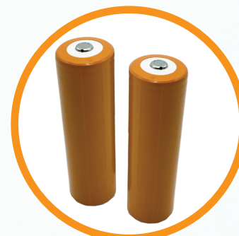
2 BATTERIES 5Ah New 2024 technology