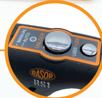
SMART BUTTON manual/automatic use selctable with safety lock

370 g only with noise suppression design